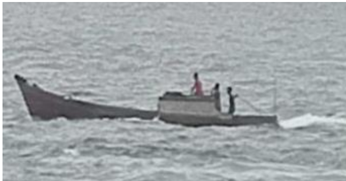
Picture of a typical wooden boat used by perpetrators in Singapore Strait