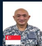
ME3 GIBERT CHIAM INFO-SHARING EXPERT