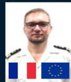
CDR STEPHAN LITZLER FRANCE/ EU ILO